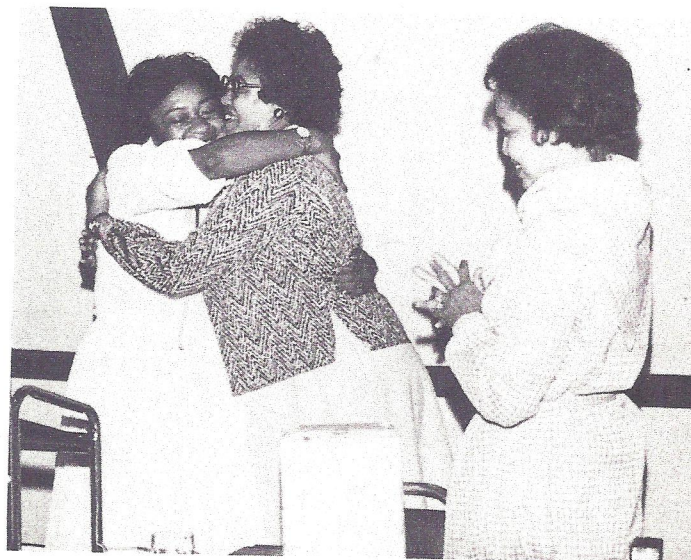
Thanks... for everything.