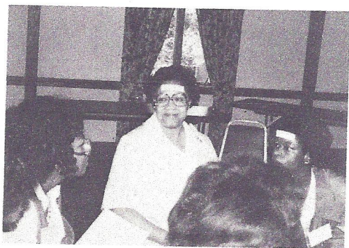
... May we treat the Supreme as the label says.