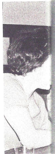
. . . But how