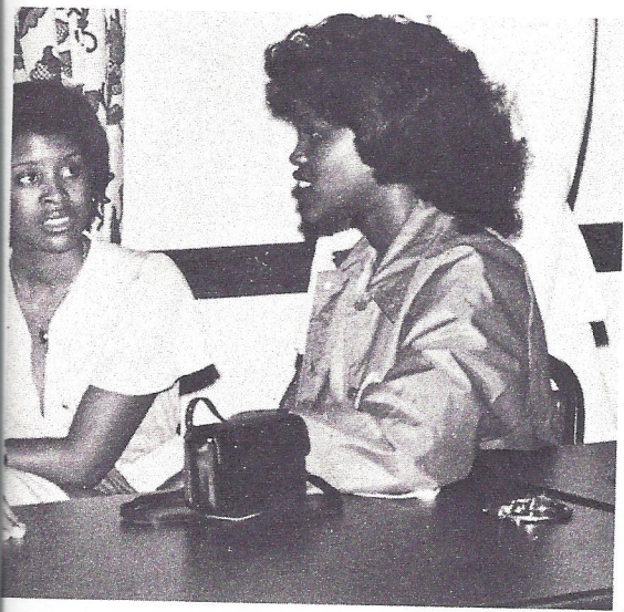
You know they said it had to be an original project.