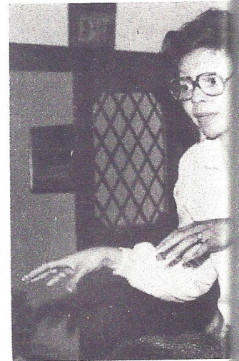
. . . The nonverbal cues are too; and, don't you forget it: