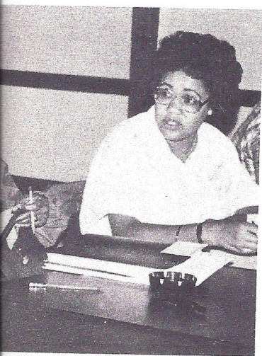
message across to them?