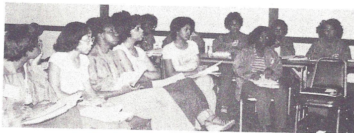
Believe us, the sessions weren't that bad.